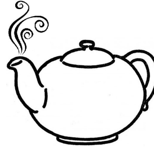
POT OF TEA £2.00