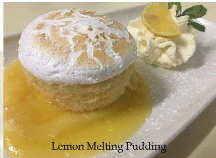
Lemon Melting Pudding