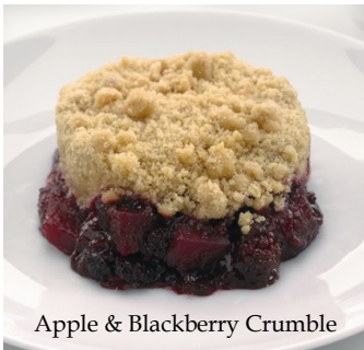
Apple & Blackberry Crumble

Layers of chocolate & coconut truffle topped with almonds and pistachios in a glaze drizzle served with dairy free ice cream