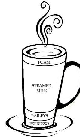
BAILEYS LATTE £4.75