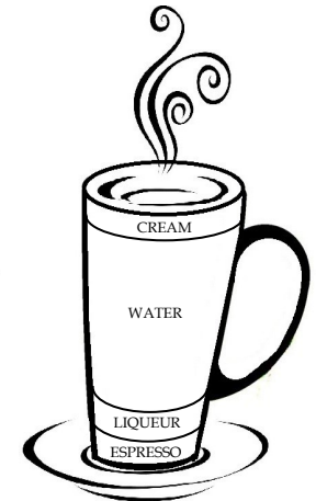
LIQUEUR COFFEE £4.95