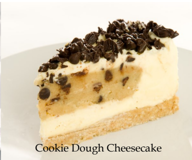
Cookie Dough Cheesecake