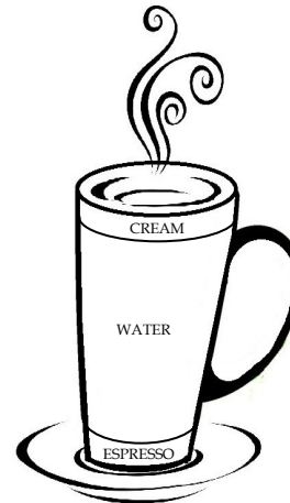
FLOATER COFFEE £2.65