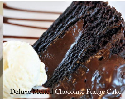
Deluxe Melted Chocolate Fudge Cake