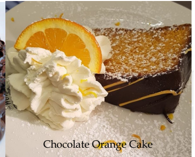
Chocolate Orange Cake